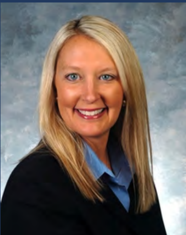
Senator Julie Raque Adams